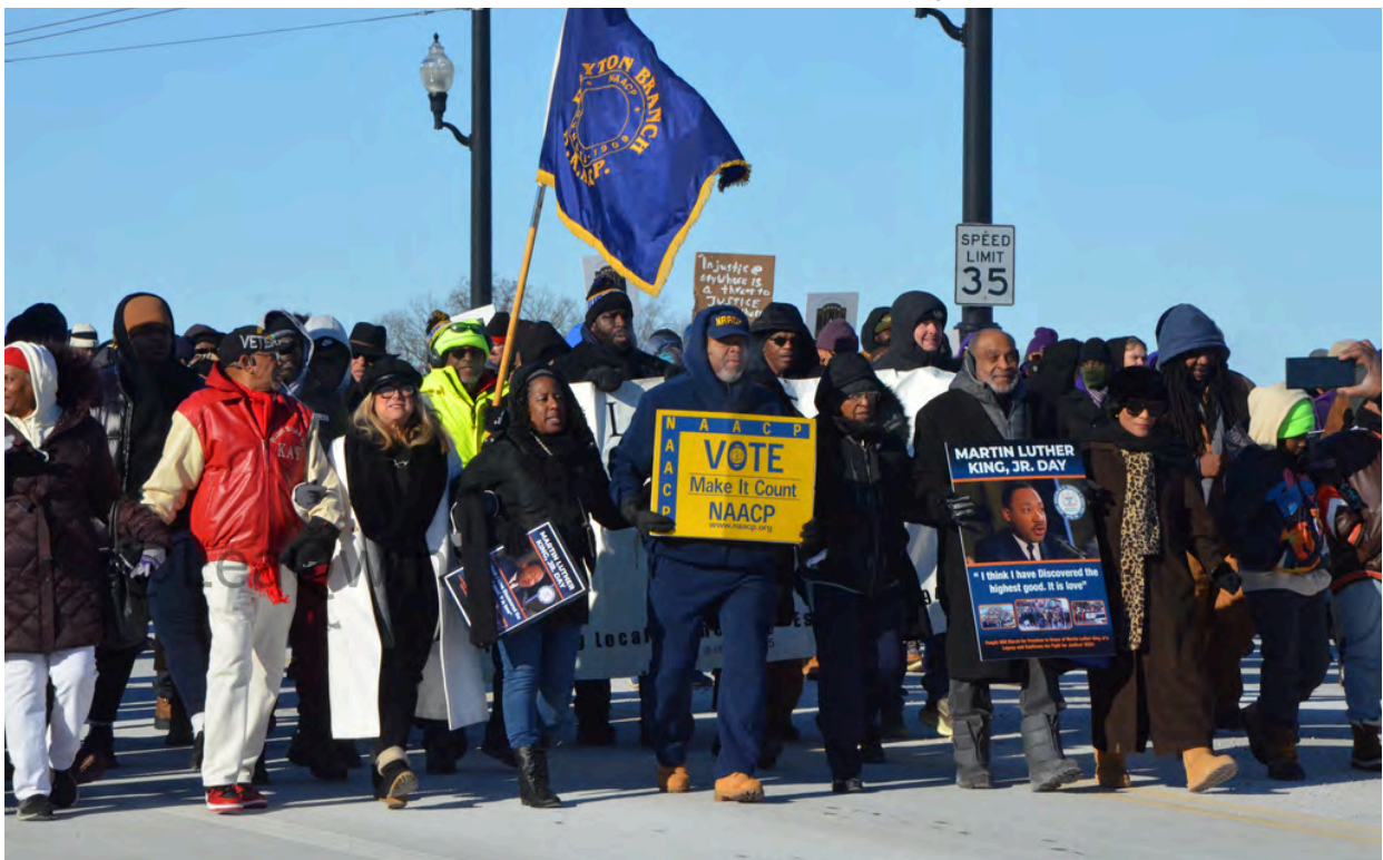
Foward Quoted in Dayton Daily News Article Titled, It's Worth it: Daytonians Brave Subzero Chill for MLK Day March