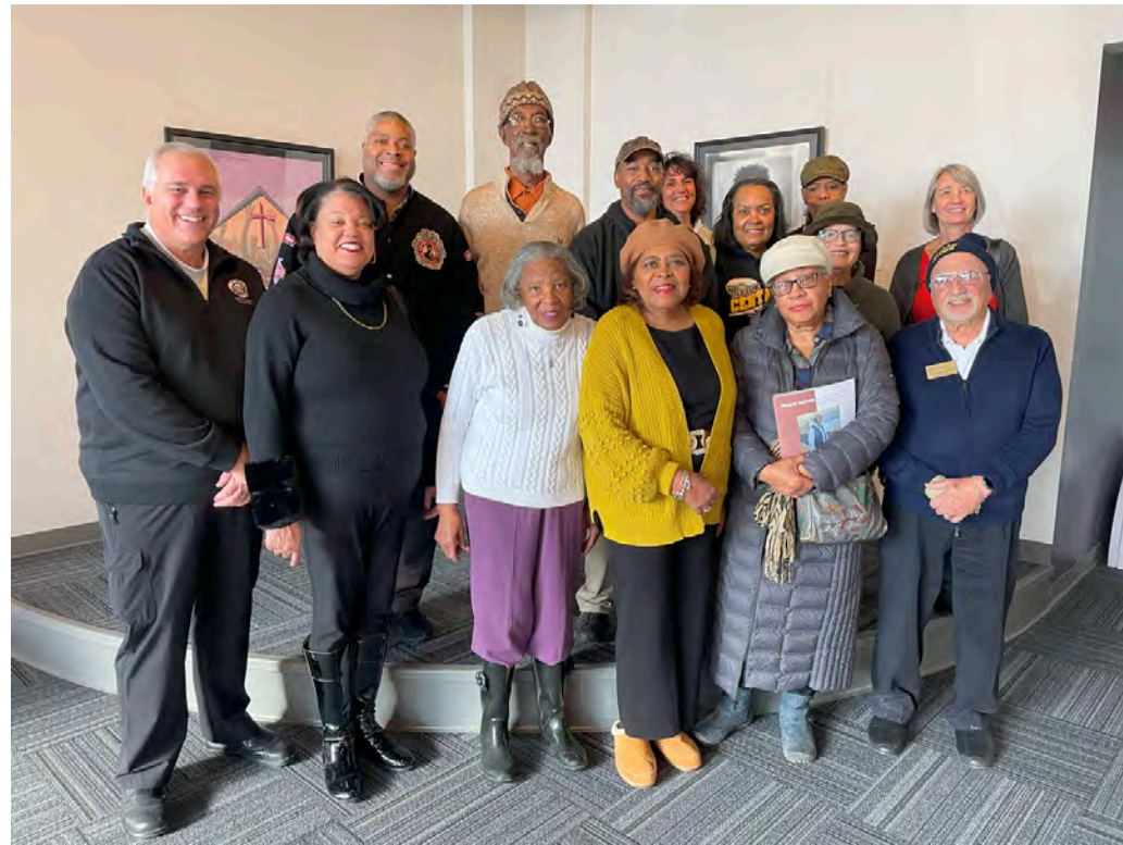
The President's Club of Dayton Tour of Wright Dunbar Art District