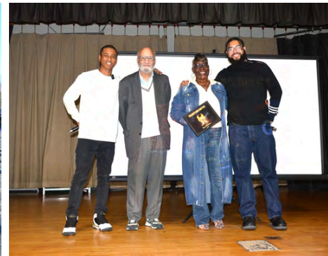
Disrupting Dayton: Film Premiere & Art Show