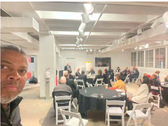
Dayton Dialogue on Race Relations Work Session