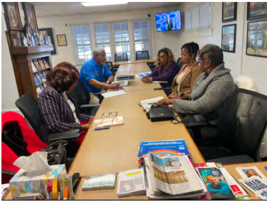
Education Committee Meeting With Dayton Public Schools Officials