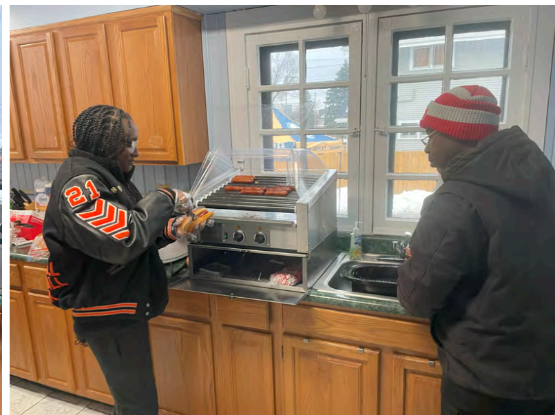
Littlejohn Junior Youth Council, Move Foward Thurgood Marshall, Dayton Youth Council and Dayton ACT-SO Youth Program Conducted Monthly Meeting, Held Chili Cook-Off & Toured NAACP Dayton Headquarters.