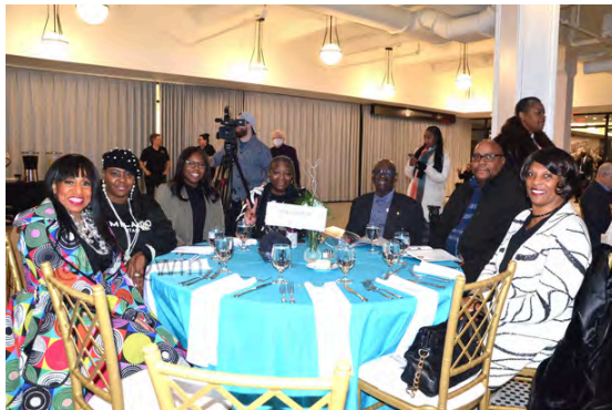
MLK Banquet Dinner