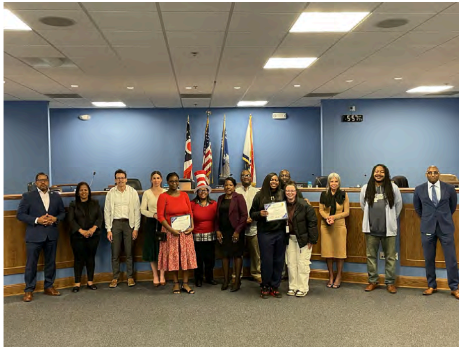
Littlejohn Junior Youth Council Members Learning About the History of the Presidents of the Dayton Branch NAACP