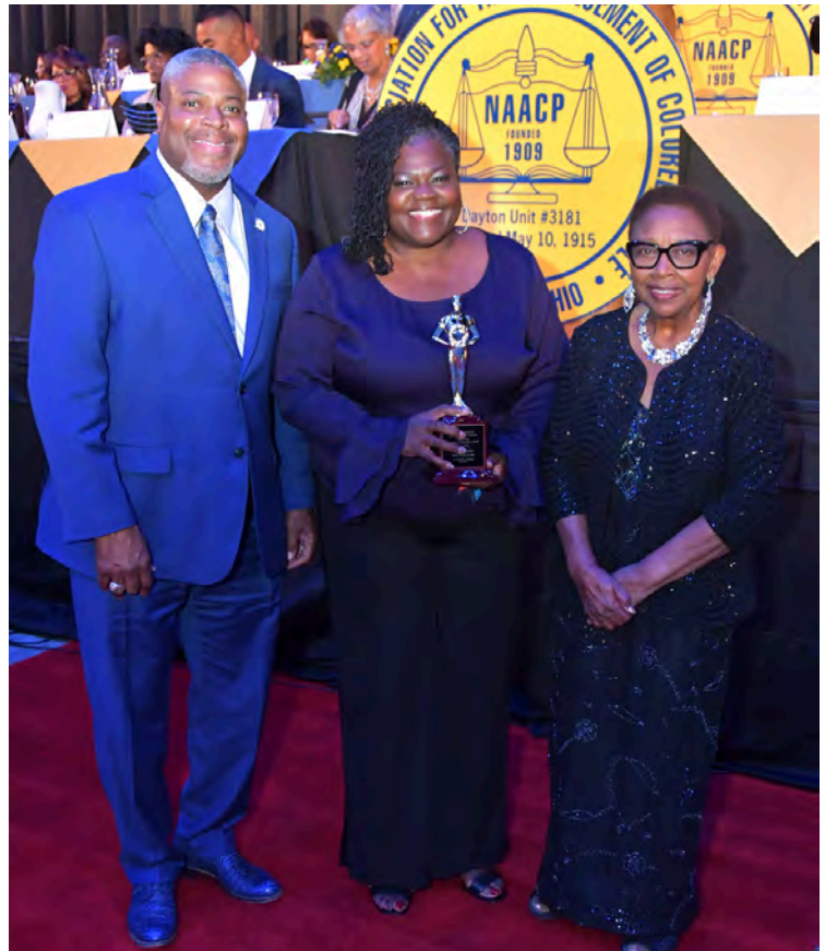
Louise Troy Excellence in Education Award